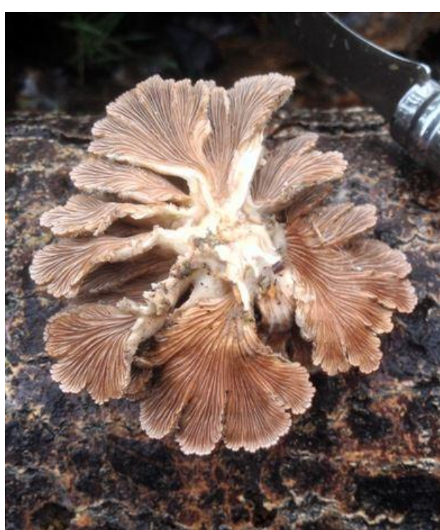
Figure 2. Trametes versicolor found on a Ponderosa stump.

Split gill mushroom( Schizophyllum commune ) - I have found split gill mushrooms year after year growing on dead trees along rivers in the Verde Valley. These are tough little mushrooms with white furry tops and intricately flayed gills. They are often noted as inedible in American guide books, but are commonly eaten in Mexico and several other countries as a chewy meat-like ingredient in numerous dishes. Schizophyllum has also been reported to have antimicrobial activities and has been researched clinically for anti-cancer activities.