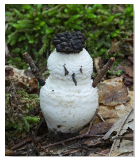
WINNING JUDGES' OPTION PHOTOS from 20016 NAMA Photo Contest!

2 – <u>htps://www.promega.com/resources/protocols/technical-manuals/0/wizard-genomic-dna-purification-kit-protocol/</u>